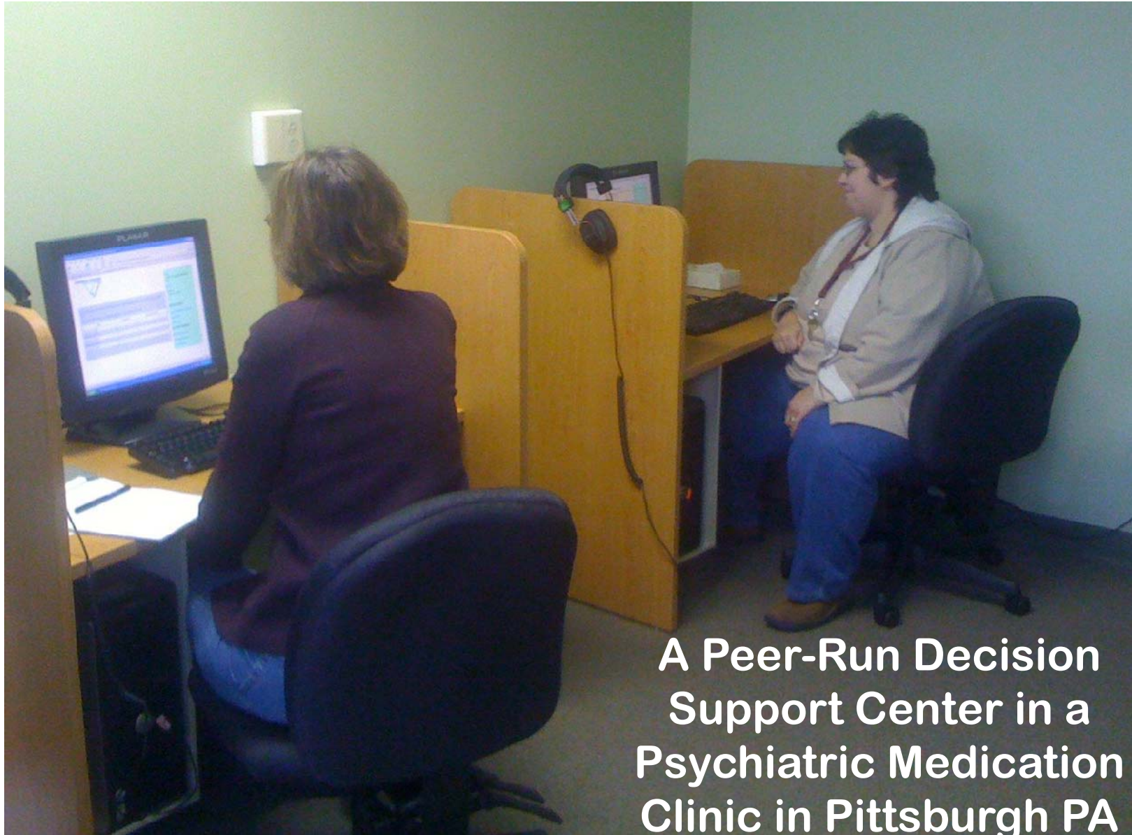
A Peer-Run Decision Support Center in a Psychiatric Medication Clinic in Pittsburgh PA